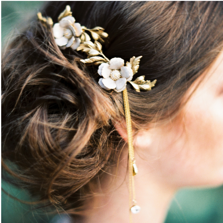
This page: Ivory enamel rose comb set with chains and crystals Style H827