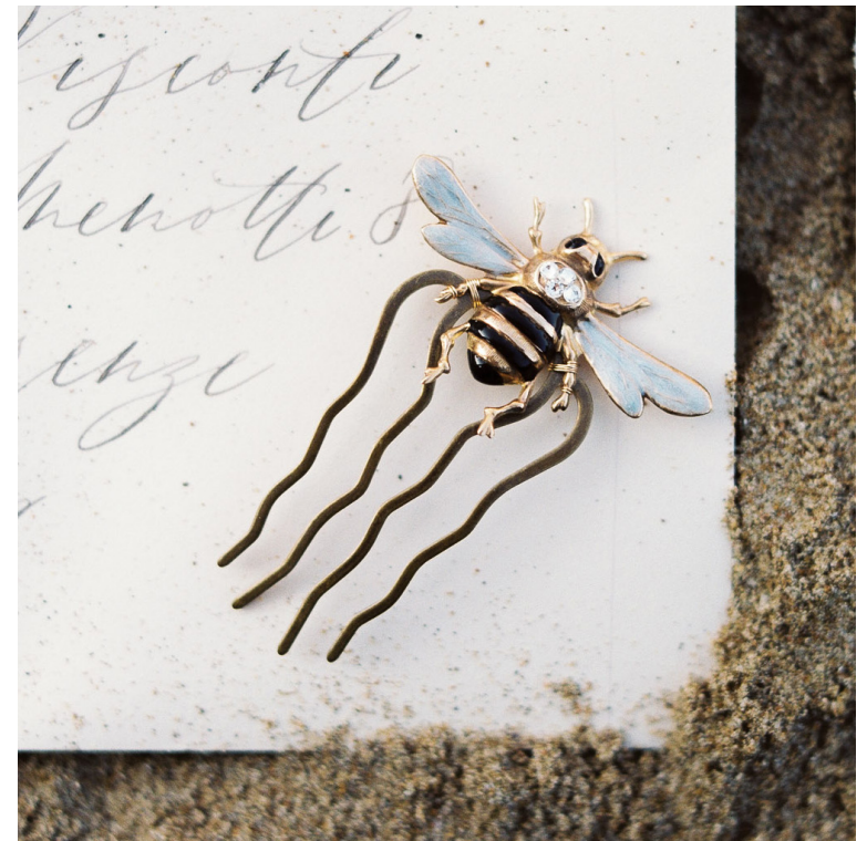
This page: Hand enamel bee combs Style H824 Next page: Chandelier earring Style H834