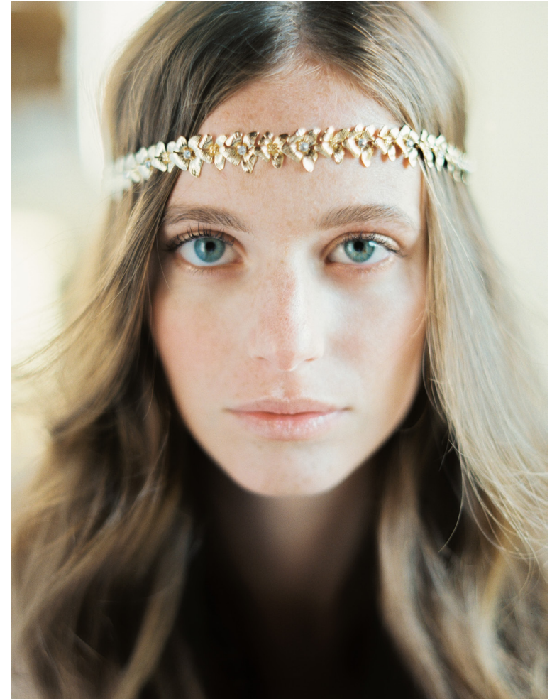
This page: Flower hair vine/choker with crystals Style H803