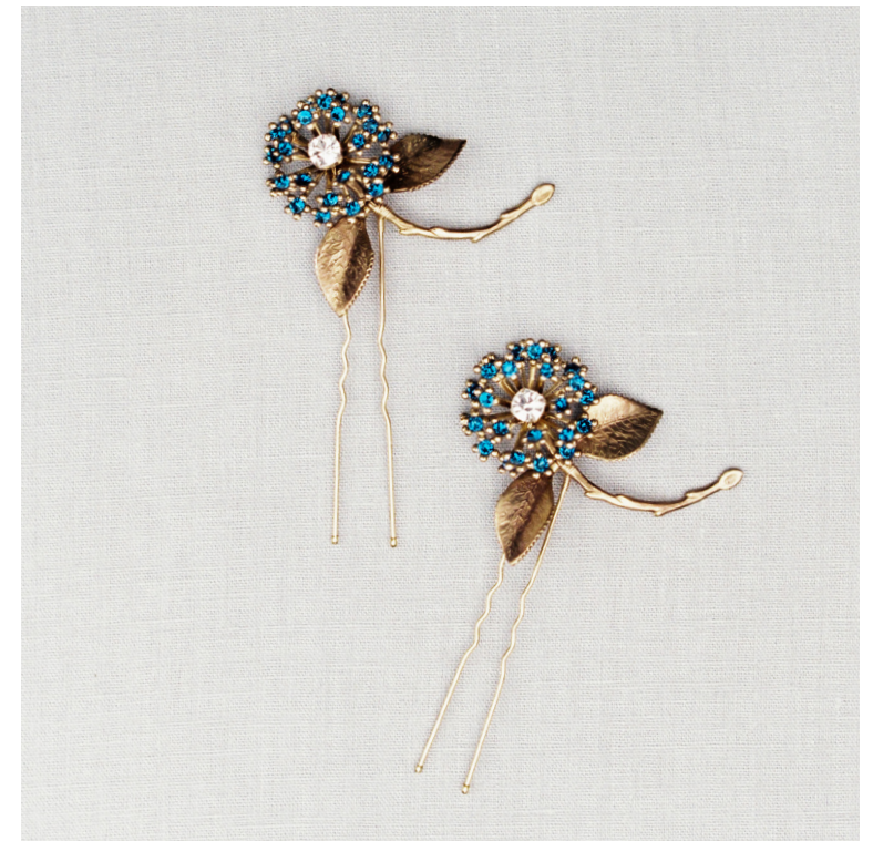
This page: Blue crystal dandelion pin set Style H817