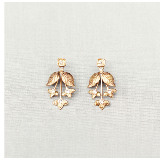
This page: Gold and blush flower pin Style H822 Gold flowers and leaves earrings Style H835