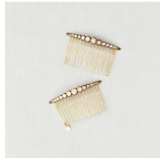
This page: Hair bands with crystals Style H809 Barrette hair combs with crystals Style H829