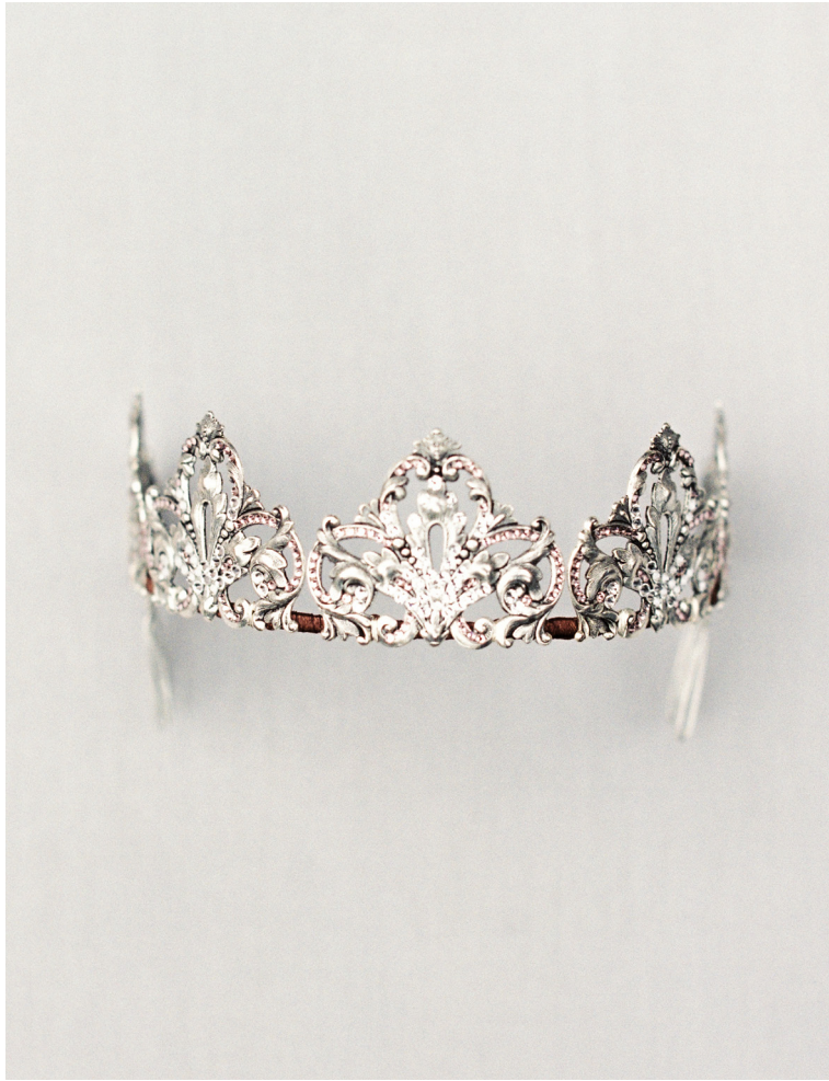
This page: Antique silver statement hair crown with blush crystals Style H806