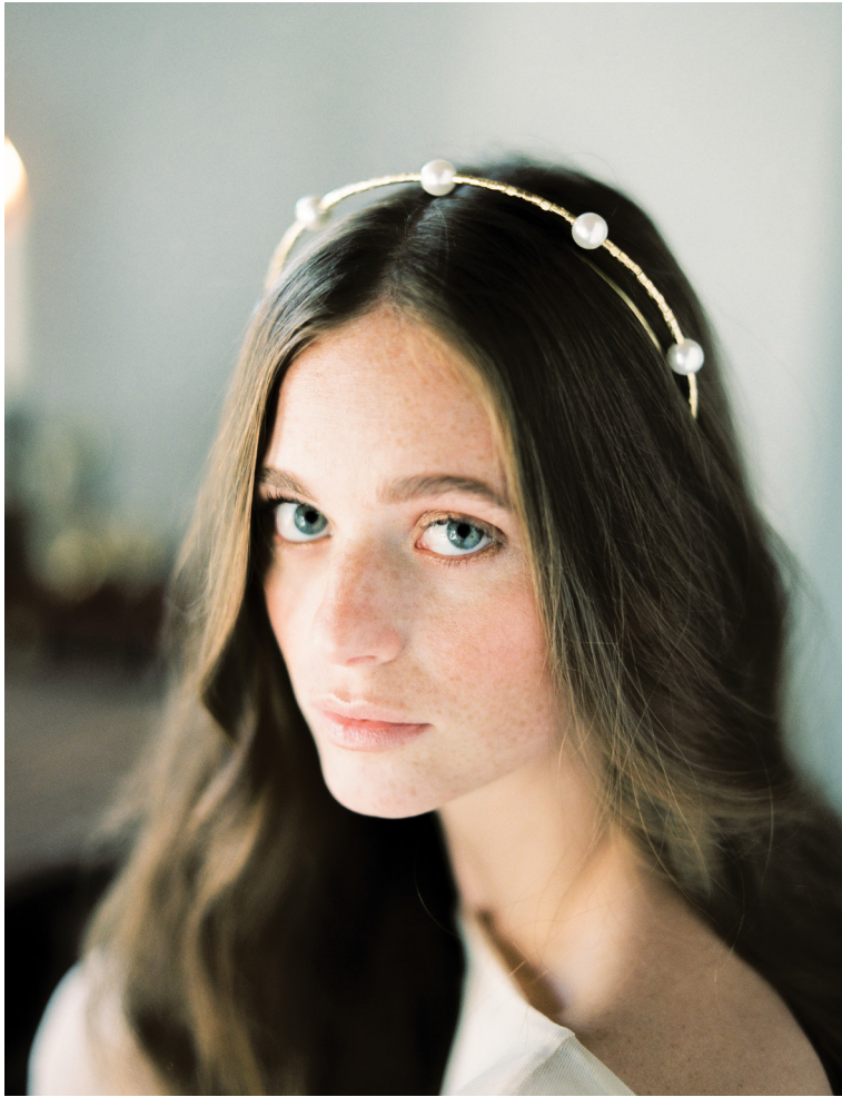
This page: Hair bands with pearls Style H811 Next page: Earrings with golden leaves and pearls Style H837