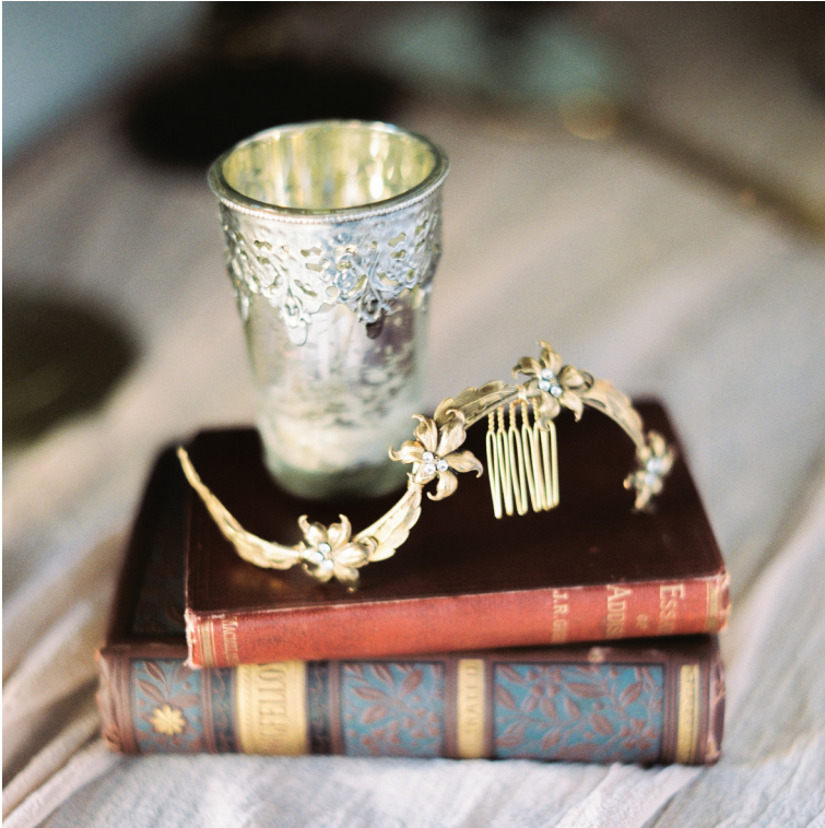
This page: Hair comb with embellished flowers Style H816 Double hair band with gold plated beads Style H812