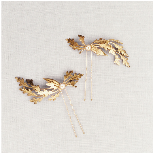
This page: Gold plated crystal earrings Style H836 Golden oak pins Style H823 (available left and right)